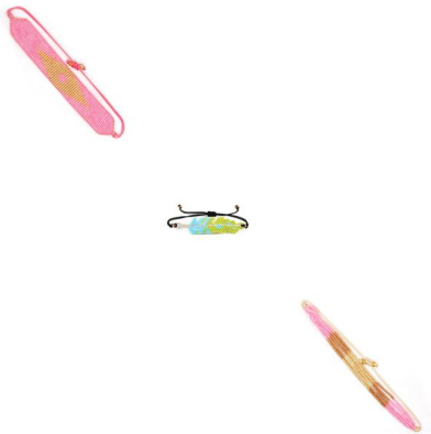
Miyuki Rice Beads Weaving Devil's Eye Handmade Jewelry Bohemian Ethnic Style Multi Layer Beaded Folded Bracelet